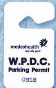
Hang Tag Parking Permits